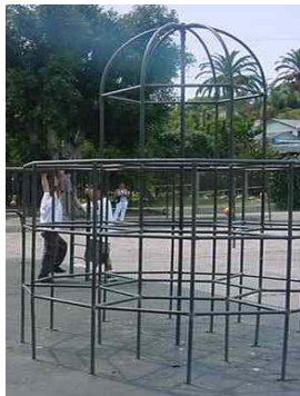
Above: An Example of the Old Equipment.

More than half of the schools in the District have replaced their old playground equipment with newer, safer and FUN equipment. OEHS reviews and provides the approval for each playground structure before it is installed at a school.