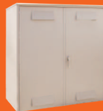
Outdoor Storage Box 60"W x 73.5"H x 96"D 100-21-50100 $2,275.00/each