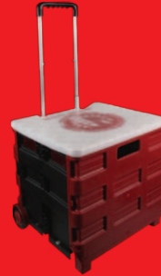
Emergency Supply Cart 560-69-00105 $22.99/each