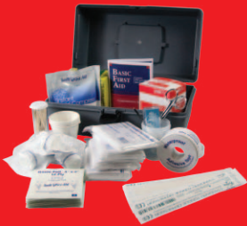
First Aid Kit 345-32-48300 $39.53/each