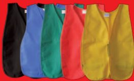
Incident Command Vests 345-92-00388 $112.99/set (10/set)