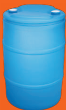
Water Barrel - 55 Gallons 100-45-70546 $44.10/each