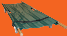
Stretcher 470-10-78050 $230.17/each