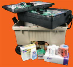
Emergency First Aid Kit 345-32-48276 $422.14/each