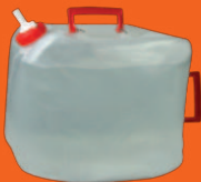
Collapsible Water Carrier - 5 Gallons 450-87-23300 $6.60/each