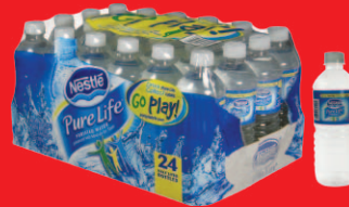
Bottled Water 390-91-07099 $5.43/cse (24 bottles/case)