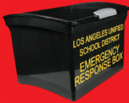
Emergency Response Box 345-32-48385 $18.53/each