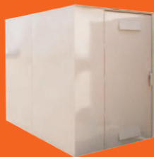
Outdoor Storage Box 72"W x 77.25"H x 38"D 100-21-71500 $1,465.00/each