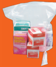
Replacement for Emergency First Aid Kit 345-32-48280 $42.99/each