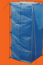
Privacy Shelter - 3' x 3' x 6' 155-70-50010 $32.50/each