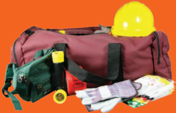
Search & Rescue Kit 345-32-48278 $255.08/each