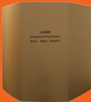
Privacy Screen - 72" x 96" 155-70-50015 $7.99/each